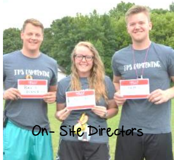
On- Site Directors