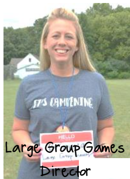
Large Group Games Director