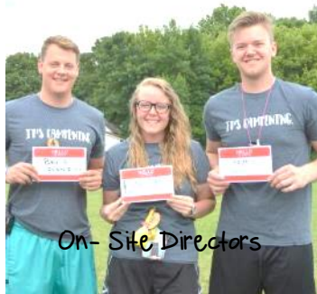
On- Site Directors